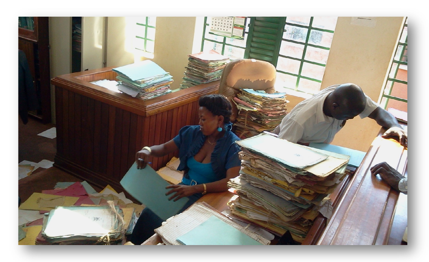
Inset: High Court Staff helping in the backlog weeding process.